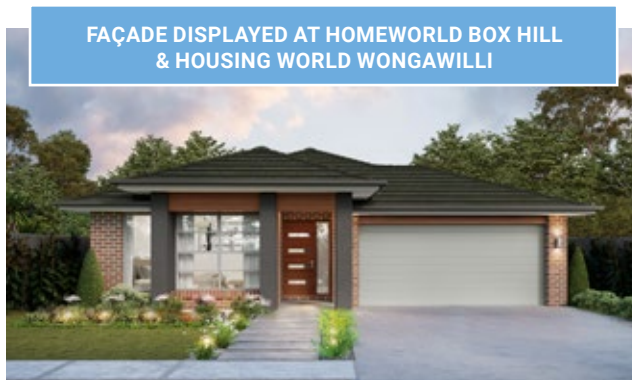
FAÇADE DISPLAYED AT HOMEWORLD BOX HILL & HOUSING WORLD WONGAWILLI