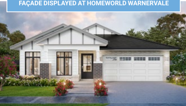
NEW HAMPTONS 24°

FAÇADE DISPLAYED AT HOMEWORLD WARNERVALE