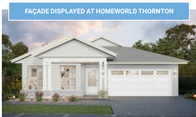
FAÇADE DISPLAYED AT HOMEWORLD THORNTON