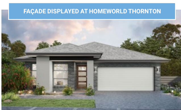
FAÇADE DISPLAYED AT HOMEWORLD THORNTON