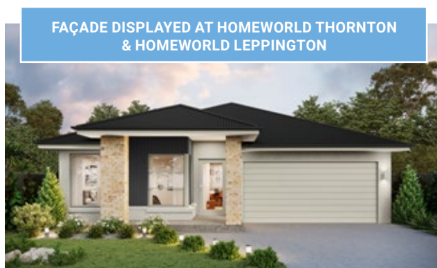
FAÇADE DISPLAYED AT HOMEWORLD THORNTON & HOMEWORLD LEPPINGTON