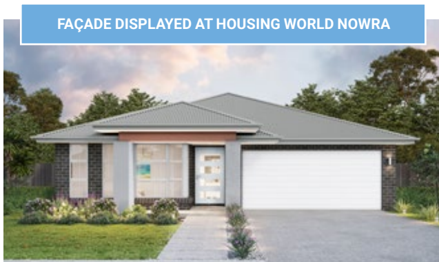
FAÇADE DISPLAYED AT HOUSING WORLD NOWRA