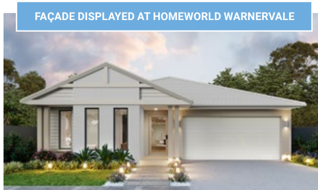
FAÇADE DISPLAYED AT HOMEWORLD WARNERVALE