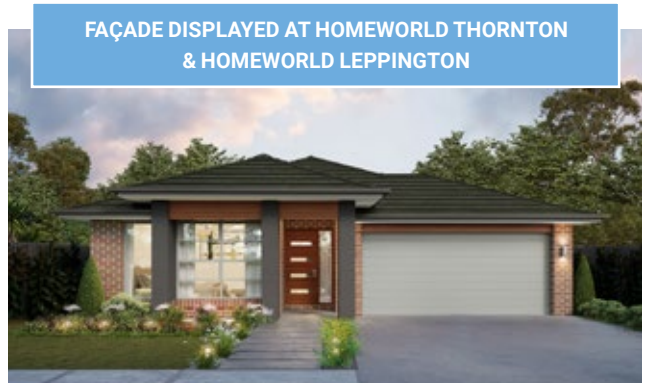
VISTA LARGO 24°