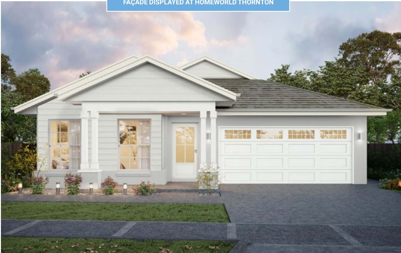
WEST HAMPTONS 24°