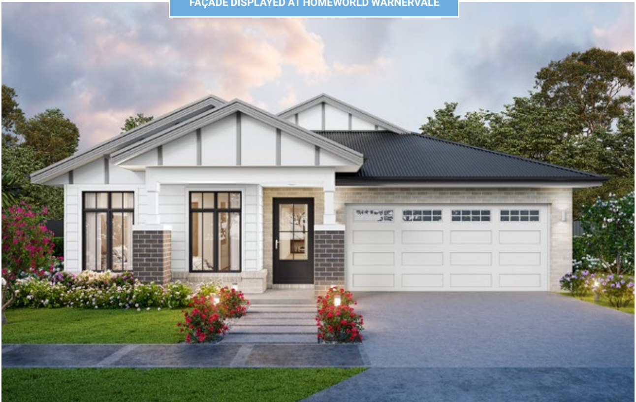
NEW HAMPTONS 24°

FAÇADE DISPLAYED AT HOMEWORLD WARNERVALE